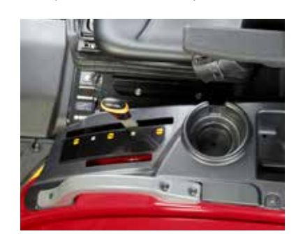
Comprehensive implement range makes these tractors suitable for any application and any weather

Levers are conveniently and ergonomically located on both sides of the operator for intuitive operation.