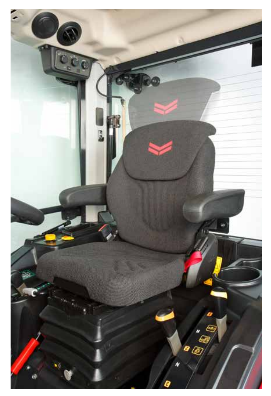
Deluxe seat for optimum comfort