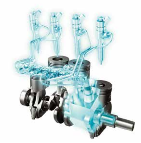
Common-rail Injection system

Strike a balance between high power/high performance and minimised emissions for the lowest possible environmental impact.