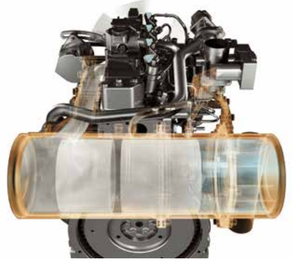
DPF (Diesel Particulate Filter)