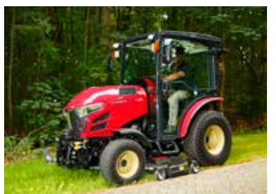
The precision of the mid-mower