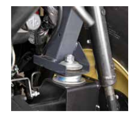
Factory-installed for precision

A system of anti-vibration rubber body mounts has been designed to reduce both vibration and noise while you work, giving you a comfortable ride and keeping you from the conventional wear and tear of extended hours on the job.