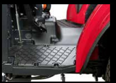
A flat floor provides ample leg room