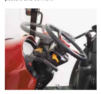
Steering adjustable to suit operator

Full adjustment allows operator to set machine to perfectly match his height, posture and comfort.