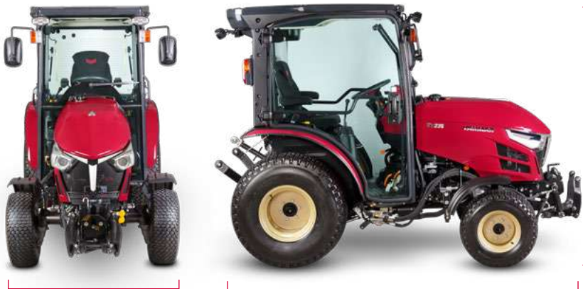
1.350 mm 3.063 mm 2.060 mm Width and height may vary, based on tire type

YT2 tractors were designed and developed to be a “pleasure to own”. And that is precisely what Yanmar has achieved.