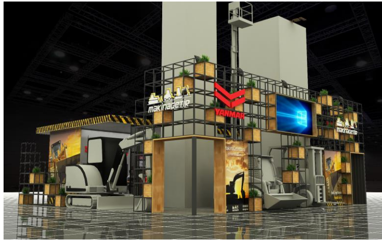
Design of the Yanmar booth at the Marble Izmir Fair

Marble İzmir Fair: https://marble.izfas.com.tr/index.php/en/