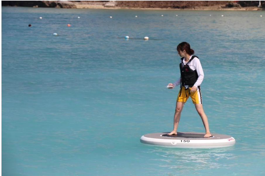
The Wheebo offers users fun times on the water

Osaka, Japan (April 29 th 2019), Yanmar has developed a new marine activity called the Wheebo, based around the concept that anyone can enjoy exciting new experiences on the water. The Wheebo expands upon Yanmar’s long commitment to delivering excitement in the realm of recreational marine and enriching people’s lives through providing rich and fulfilling experiences.