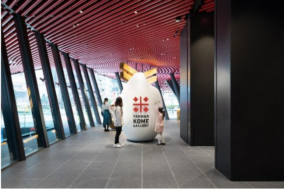
YANMAR KOME GALLERY