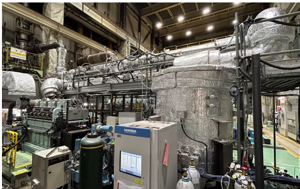
[Methane Oxidation Catalyst System Test Bench]

The Hitachi Zosen, MOL, and Yanmar PT will work to quickly establish a technique for reducing methane slip through this project and actively contribute to reducing greenhouse gases emissions in the global marine transportation sector.