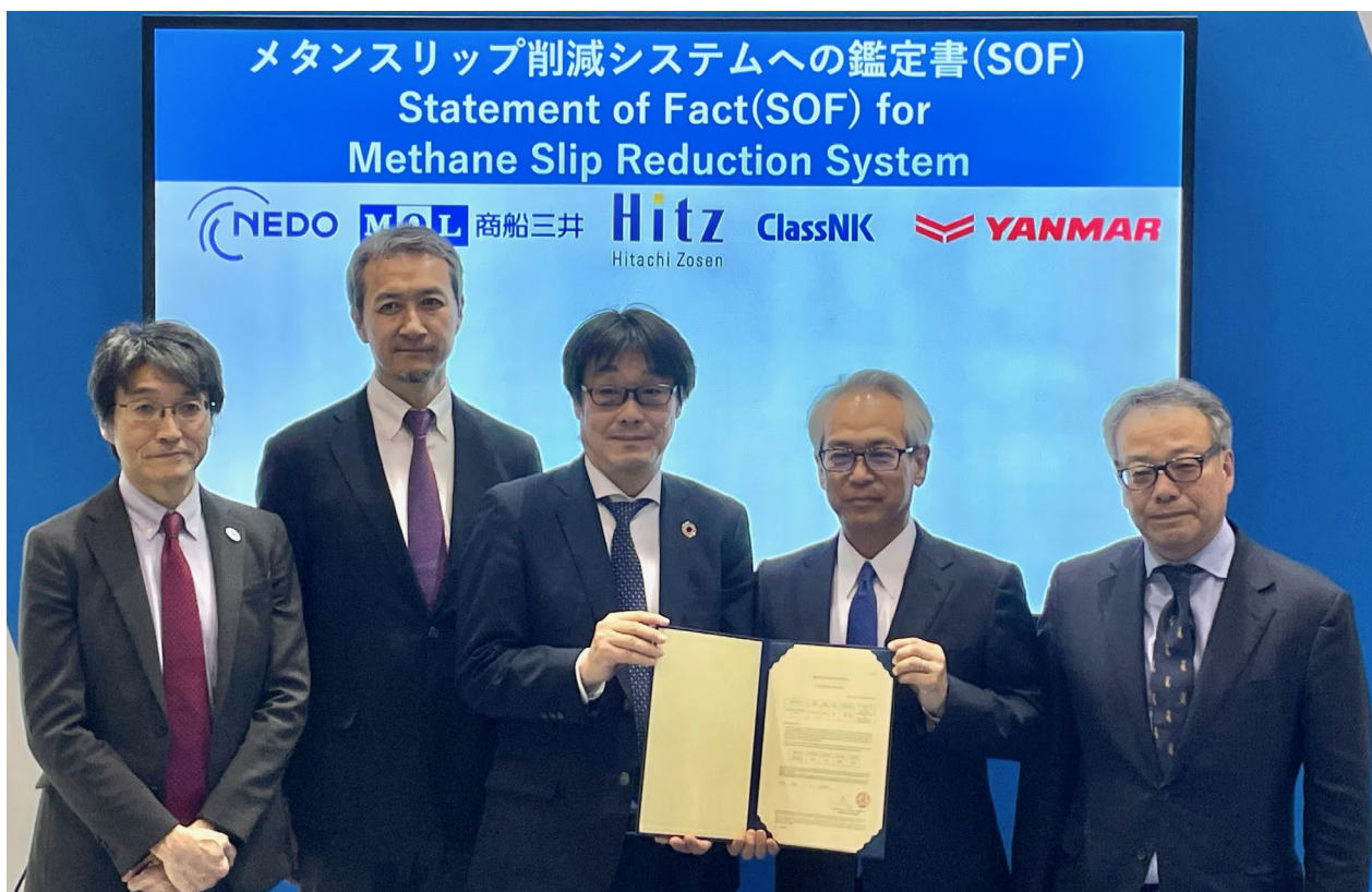
[Ceremony to receive the SOF]

Hitachi Zosen Corporation (hereafter, Hitachi Zosen), Mitsui O.S.K. Lines, Ltd.(hereafter, MOL), and YANMAR POWER TECHNOLOGY CO., LTD. (hereafter, Yanmar PT) achieved a 93.8% of reduction rate (at an engine load rate of 100%) in the development of the technology to reduce the methane slip *1 from LNG-fueled vessels through catalyst and engine improvements (hereafter, this project). This project was adopted by the New Energy and Industrial Technology Development Organization (hereafter, NEDO), and the achievement of the reduction rate was confirmed by ClassNK (NK) through the Statement of Fact (SOF) for the first time in the world.