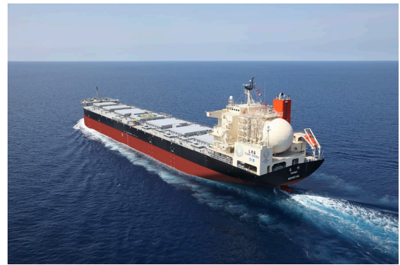
[Demonstration Vessel REIMEI (Reimei)]