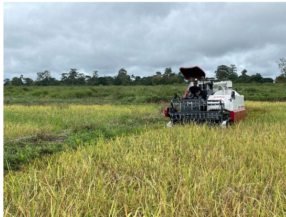
Farming operations in Côte d'Ivoire

As part of this alliance, ATC's headquarters in Côte d'Ivoire will serve as the central hub for operations, providing tractors, combine harvesters, tillers, engines, and spare parts, along with full after-sales service, across all 16 West African countries.