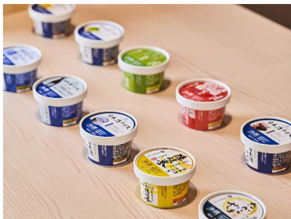
Japanese sake ice cream