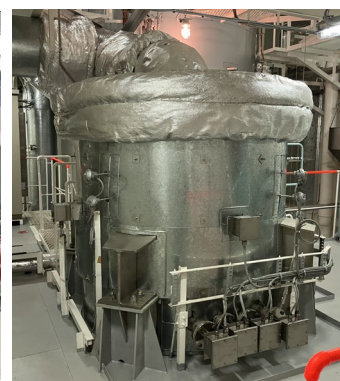
[Methane slip reduction system on board (Left: EGR Note2 system, Right: Methane oxidation catalyst layer)]

The Project, spanning six years from FY2021 to FY2026, aims to achieve a methane slip reduction rate of 70% or more for LNG-fueled vessels by combining methane oxidation catalysts with engine improvements. Its goal is to be the first in the world to socially implement methane slip reduction technology in the maritime sector, a technology that has not yet been established even on land.