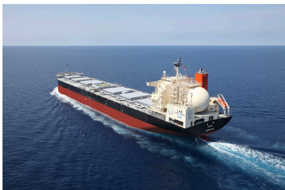
[Demonstration vessel REIMEI]

Kanadevia Corporation (hereinafter “Kanadevia”), Mitsui O.S.K. Lines, Ltd. (hereinafter “MOL”), and Yanmar Power Solutions Co., Ltd. (hereinafter “Yanmar Power Solutions”) have, under the Green Innovation Fund Project “Development of Next-Generation Vessels” led by the New Energy and Industrial Technology Development Organization (hereinafter “NEDO”), been working on the project “Development of Methane Slip (Note1) Reduction Technology for LNG-Fueled Vessels through Catalyst and Engine Improvements” (hereinafter “the Project”). As part of the Project, full-scale demonstration trials began in May 2025 on routes including between Japan and Australia, achieving a methane slip reduction rate of 98%, far exceeding the target of 70%.