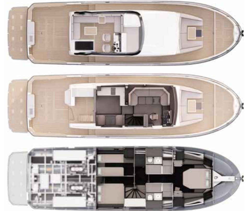
Standard Layout - Optional variations available